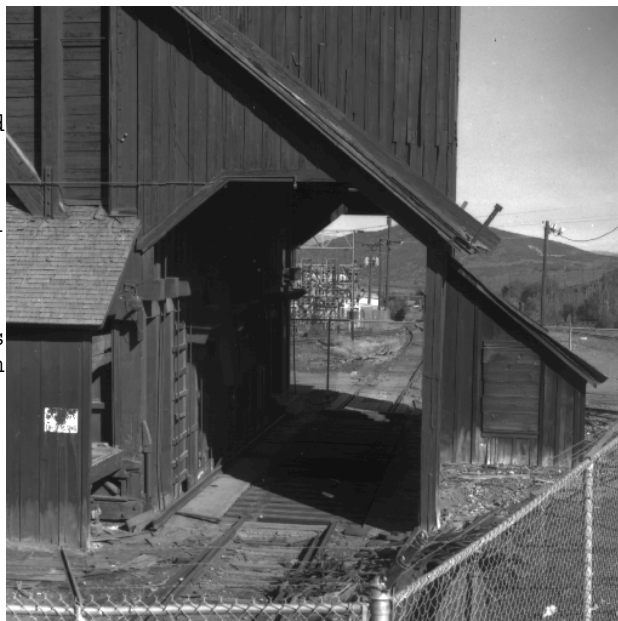
Utah building scanned as 512x512 8-bit samples

The halftoning technique used here is error-distribution with a 65-line screen added. This technique is described in detail below.